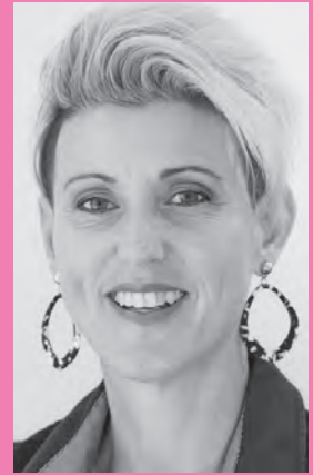
Educator / KEYNOTE Speaker 0412 551 498